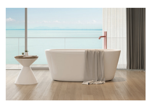
Structure below a floor covering