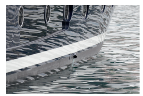
Hulls through paint and antifouling

Corrosion costs time and it costs money. In fact, the collective global cost of corrosion to shipowners has been estimated between $50bn and $80bn according to The Association for Materials Protection and Performance (AMPP).